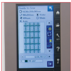
180 Built-in designs and 6 fonts for monograms