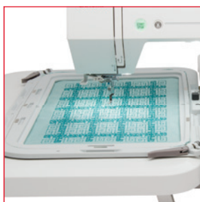
Maximum Embroidery Size: 7.9" x 14.2"